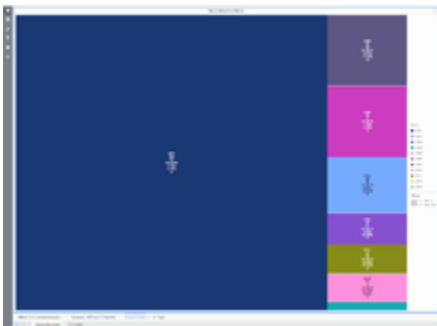
Weekly Queue Summary Dashboard: Queue Volume

The ( Dashboards and Queues folders) Weekly Queue Summary Dashboard provides visualizations you can use to assess the weekly performance of configured queues, to understand what percentage of interactions in each queue were accepted within the defined service level, to detect high rates of abandonment, and to compare the performance of each queue in handling interactions.